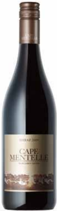
Cape Mentelle Shiraz

Cape Mentelle’s shiraz takes inspiration from the techniques and wines of France’s Northern Rhône Valley. The fruit is destemmed only, cold soaked and traditionally fermented. Maturation in both large oak vats and small barriques is aimed at retaining the refined fruit and floral characters of the variety along with the more savoury, spicy elements derived from the vineyard.