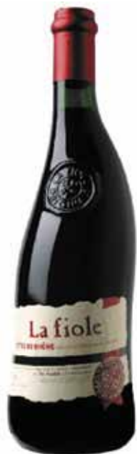
Cotes du Rhone

Deep ruby color with slight tile tints. Bouquet of small stone fruits, spices (thyme, pepper) as well as “garrigue” notes. The mouth is warm, supple, ample and elegant with delicate tannins. Undergrowth and liquorice notes are together with fruit aromas in the finale.