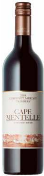
Cape Mentelle Cabernet Merlot

A vibrant, fruit-driven wine with distinct blackcurrant and satsuma plums plus a touch of lavender, leading to a medium to full bodied palate with soft and elegant tannins. A satisfying gravelly structure balances the fresh fruit characters to provide length and complexity.