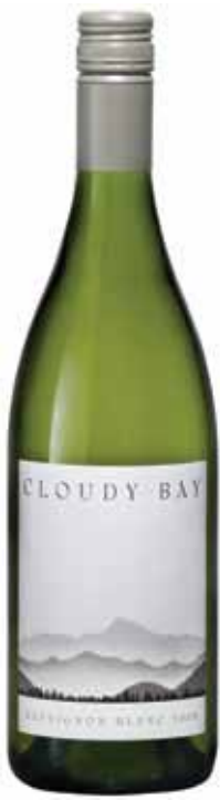
Cloudy Bay Sauvignon Blanc

Generosity is the defining word for the 2009 Cloudy Bay Sauvignon Blanc. Its aromatics encapsulate a broad spectrum of varietal flavours; tropical fragrances of guava and mango to ripe lime/ citrus and sweet herbs. The palate also is juicy and voluminous, combining concentrated flavours with a mineral acidity that leaves a long, fresh, intense finish.