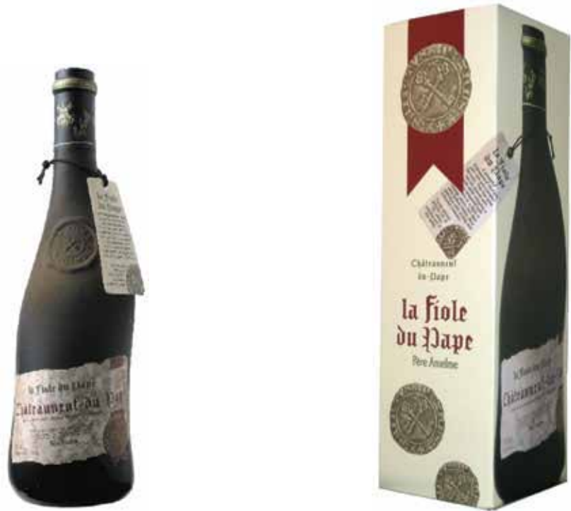
Chateauneuf du Pape

Brilliant ruby colour with tile tints, showing a good maturity. Complex, warm and pleasant nose combining aromas of dry fruits, wood, truffle, venison, spices; all in a perfect harmony. In the mouth, this wine surprises by its unctuousity at first and its powerful tannins at the end.