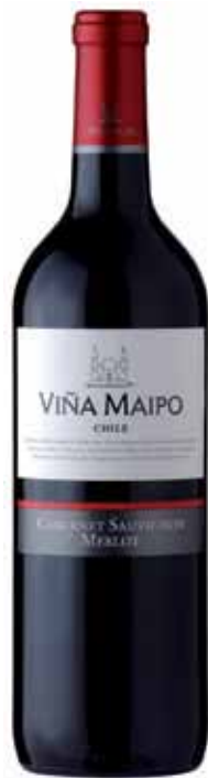
Cabernet Sauvignon Merlot