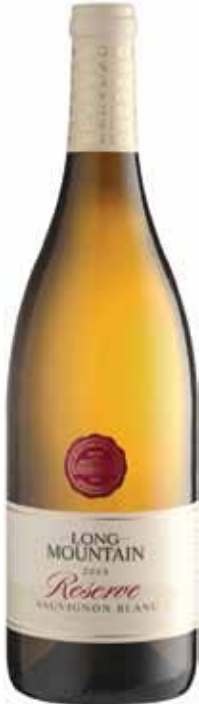
Sauvignon Blanc Reserve

A lively yet sultry wine with luscious pears and guavas underpinned by crisp citrus aromas. Hints of ripe tropical fruit that are full of zest, yet smooth and delicious. With just the right sunlight exposure ripening occurred evenly and has ensured that this bright wine has a clean and enchanting finish.