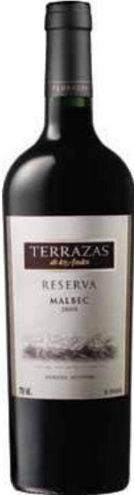
Terrazas Reserva Malbec

Intense fruits notes such as strawberry, blackberry, black cherry & plum. The aromas of liquorices & rose are perfectly combined with bitter chocolate & smooth toasted notes, coming from barrel ageing. Intense and well balanced, the tannins are smooth & well-rounded. Long & elegant final with a great concentration of fruits