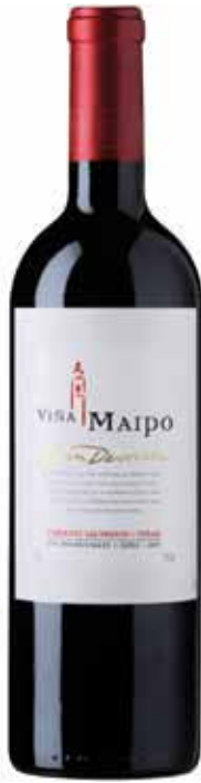
Cabernet Sauvignon Syrah

With pale yellow colour, the critic notes, fresh herbs and green apples are the characteristic notes of this expressive wine. It has a very rich acidity, with a fresh and balanced palate, giving a juicy and persistent finish.