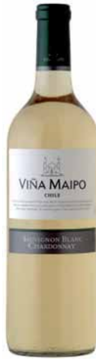
Sauvignon Blanc Chardonnay