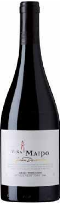
Syrah Petit Syrah