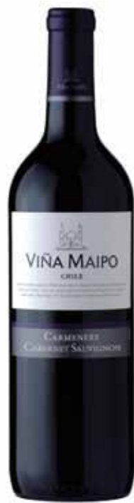
Carmenere Cabernet Sauvignon

Light yellow with touches of green, containing relatively constant small bubbles. Aromas of quince, fresh pineapple, green apple and biscuit. Good acidity, fresh and lively. Pineapple notes give way to a lighter bitter finish. Best served as an aperitif, or accompanying fish or fresh shellfish.