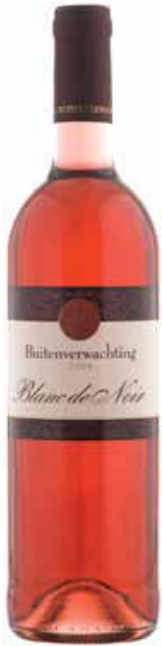
Blanc de Noir

An attractive salmon pink colour. This blend of noble red varieties offers a combination of fresh strawberry characters with aromatic peach like flavours. Matches well with sea food and any Mediterranean dishes