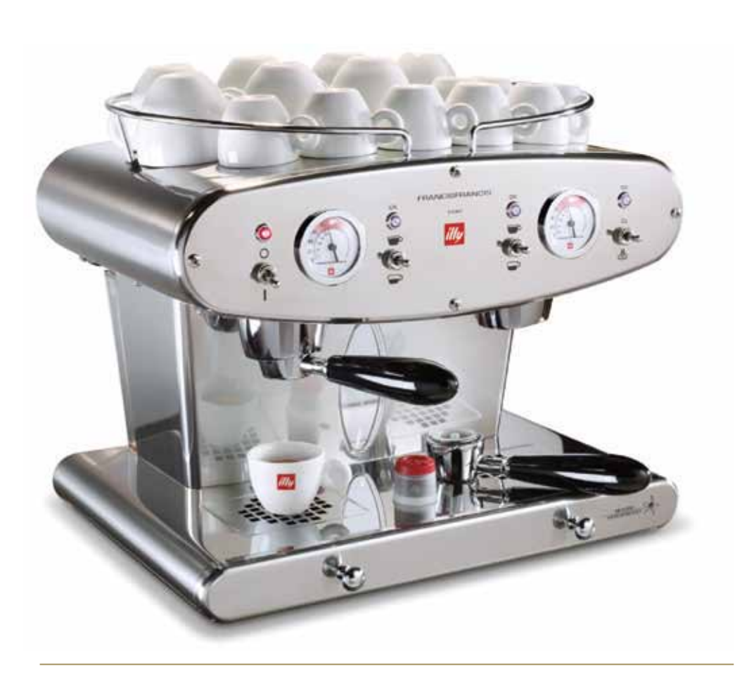
X 2.1 Ipso professional machine