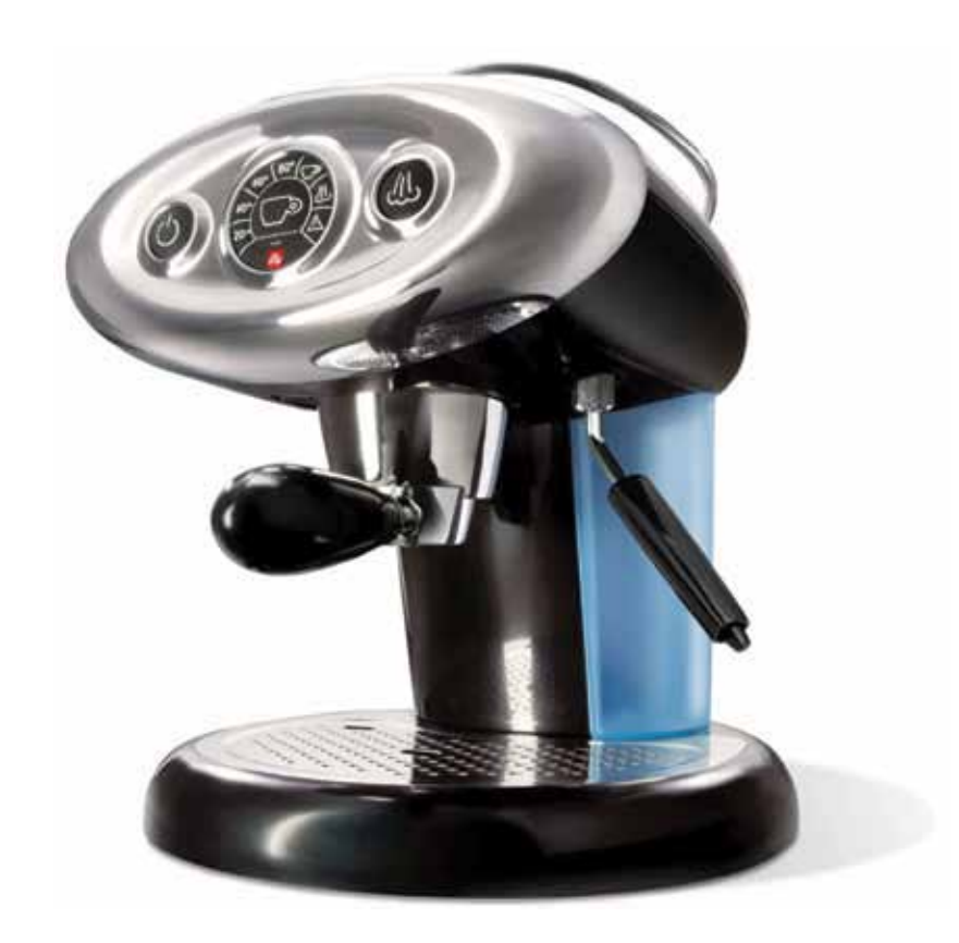
X 7.1 iperespresso machine