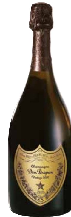
Dom Pérignon Blanc

Fresh, crystalline and sharp, the first nose unveils an unusual dimension, an aquatic vegetal world with secret touches of white pepper and gardenia. The wine reveals airy, gentle richness before exhaling peaty scents. The finish gradually unfurls and then settles, smooth, mellow all-encompassing.