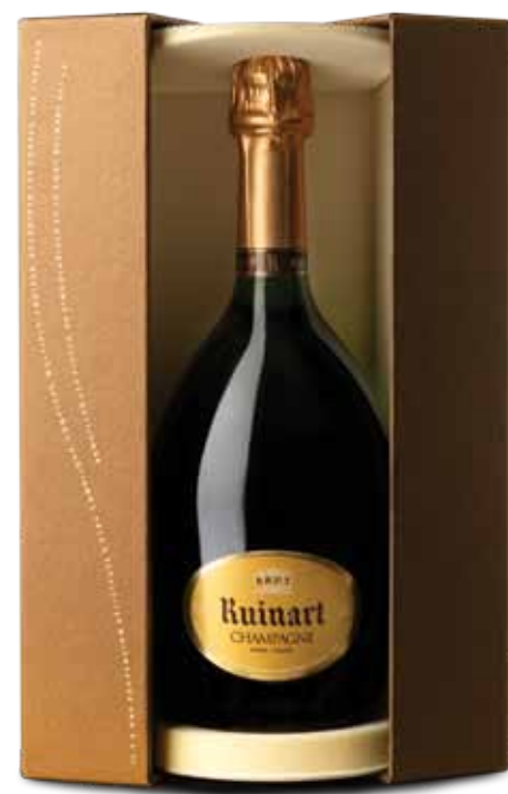
“R” de Ruinart

Ruinart Rosé, a fine, elegant champagne with the distinctive Ruinart taste due to a high concentration of Chardonnay grapes. A beautiful colour of pinkish gold. A smooth, balanced, fruity wine with a plenty of body. An ideal evening aperitif.