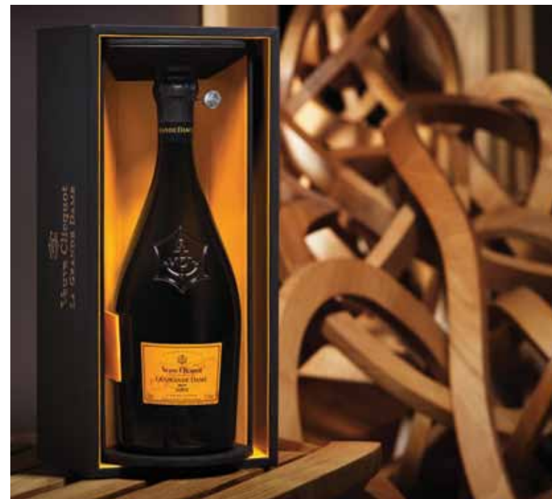
La Grande Dame Blanc

The 1998 vintage of La Grande Dame, the quintessence of the Veuve Clicquot style, reaches a peak of refinement, without losing its legendary strength produced by a blend including nearly two-thirds of Pinot Noir. The colour is a pale gold with jade glints. The wine is crystal clear, with unbelievably fine bubbles.