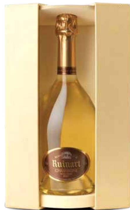
Ruinart Blanc de Blancs