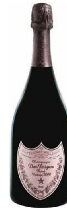
Dom Pérignon Rosé

The first perfumed floral notes quickly open up into orange peel and dried fruits, with the characteristics of a well-matures harvest and woody spices. The envelope is ample and the structure remarkably balanced, precise and sophisticated. The warm, radiant complexity persists and vibrates, barely touched by the subtlest hint of bitterness.