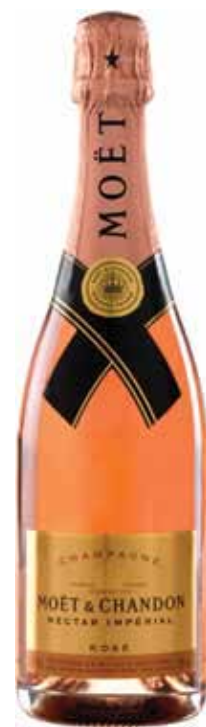
Nectar Impérial Rosé