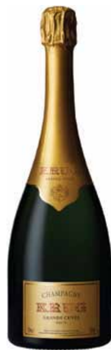
Krug Grande Cuvée